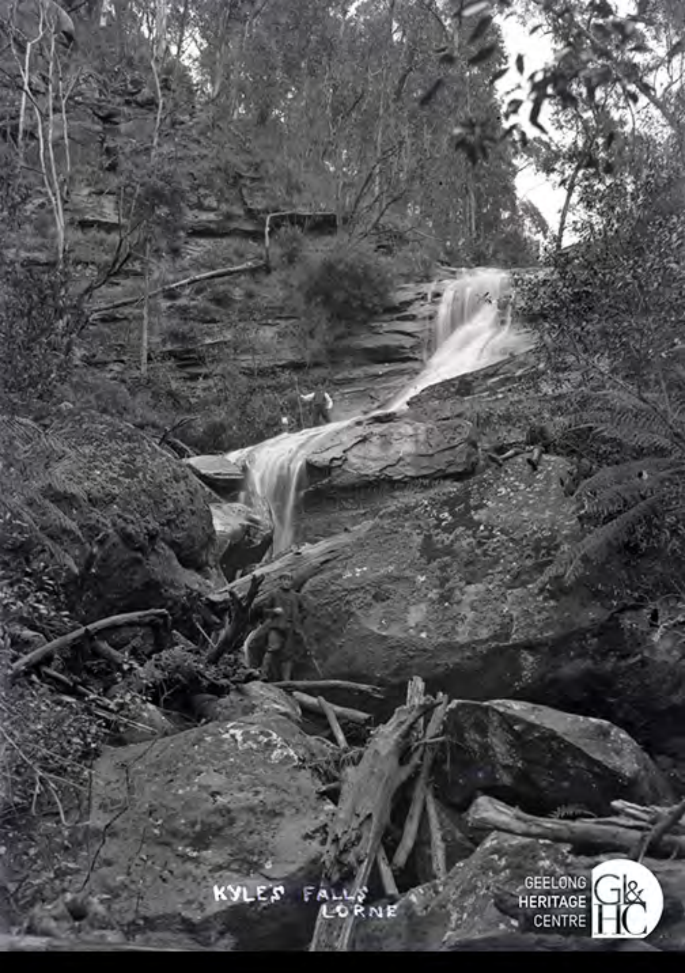
Kyles Falls Lorne c1930