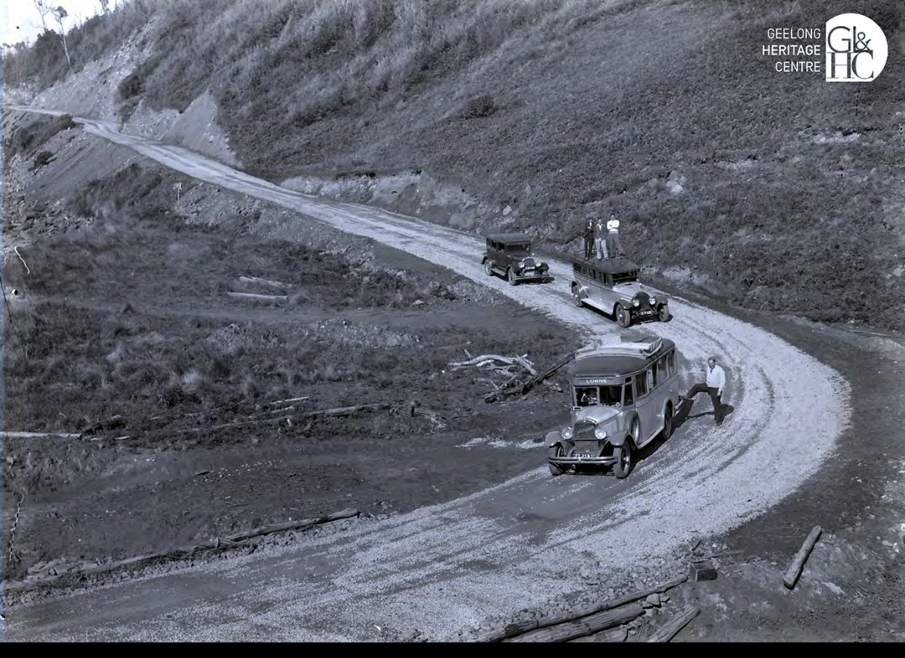
Vehicles on the road to Lorne by AE Jarratt