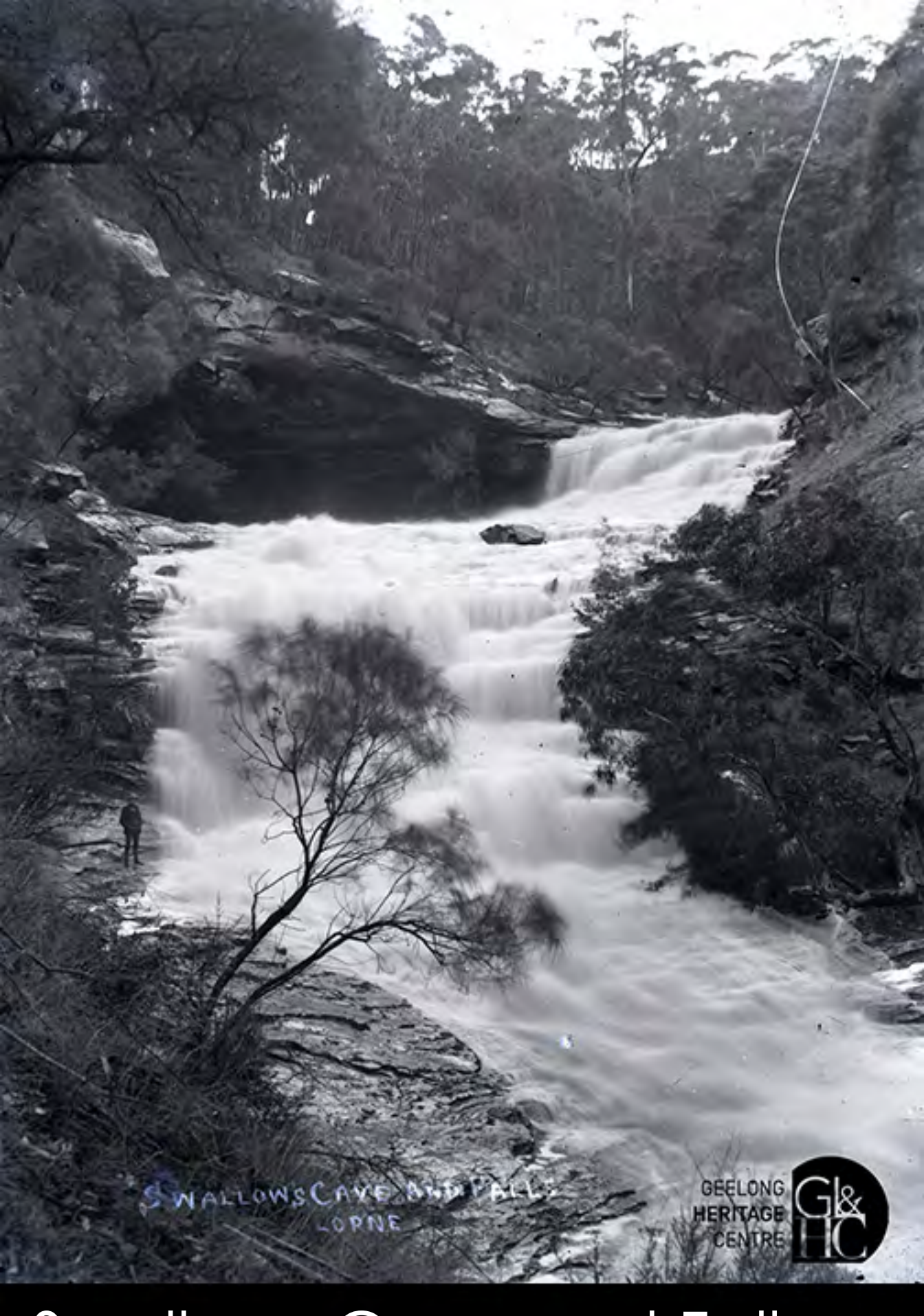
Swallows Cave and Falls c1930