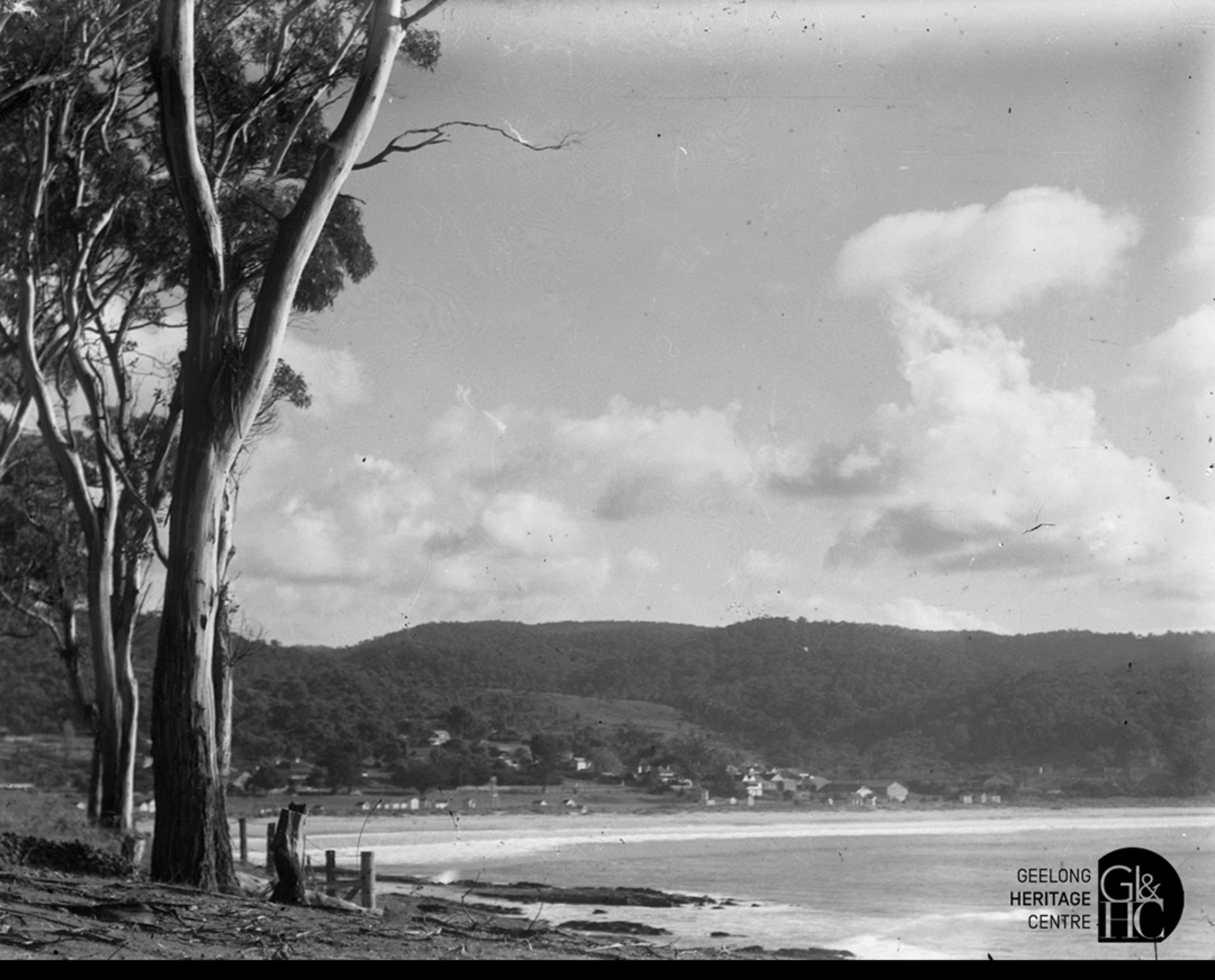
Lorne c1930 by AE Jarratt