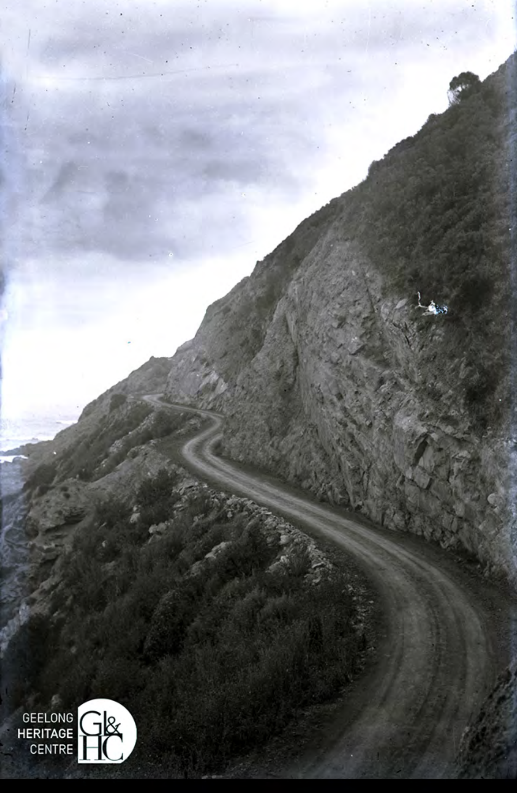
Lorne cliffs c1930 by AE Jarratt