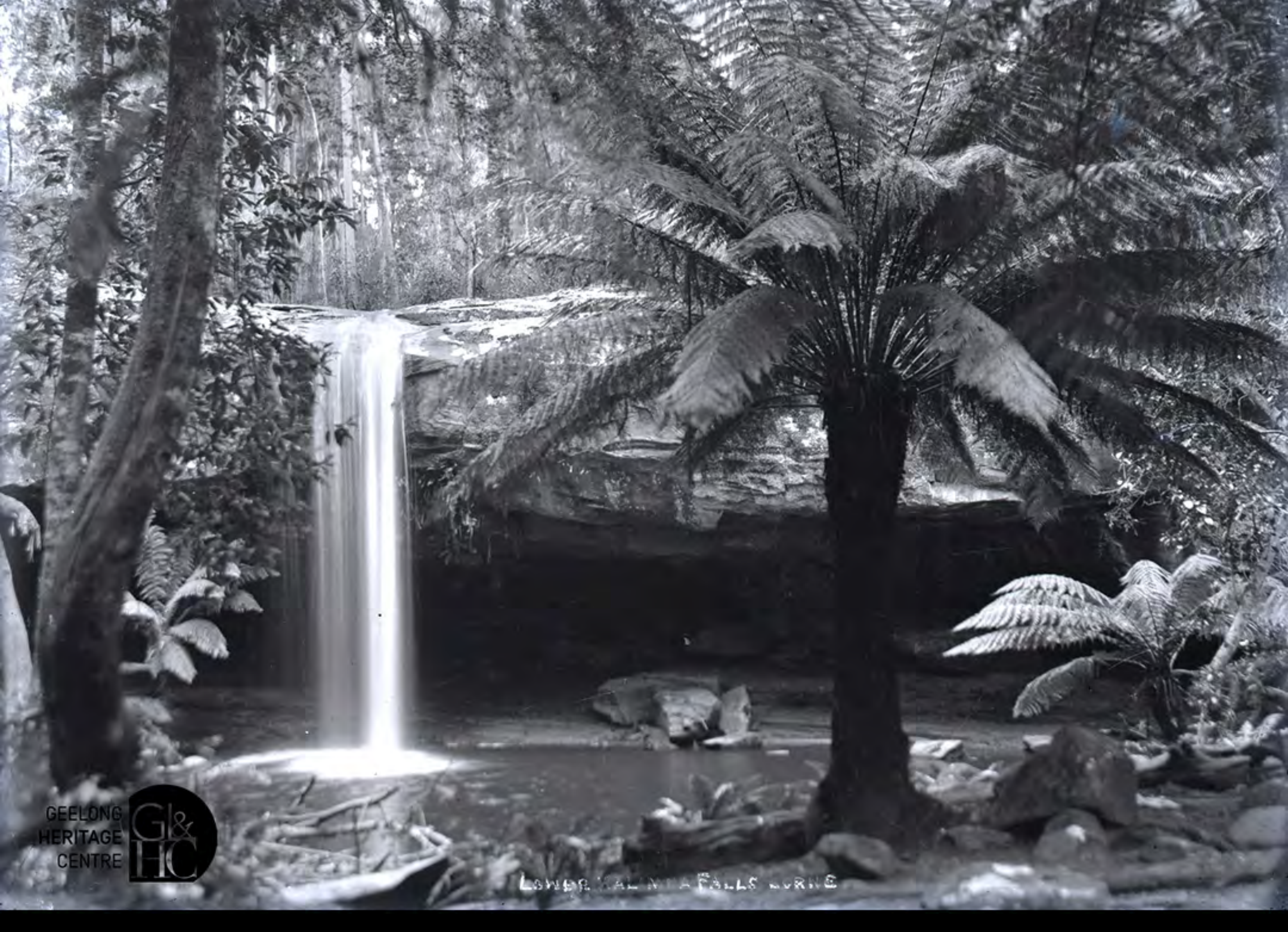
Lower Kalimna Falls near Lorne c1930