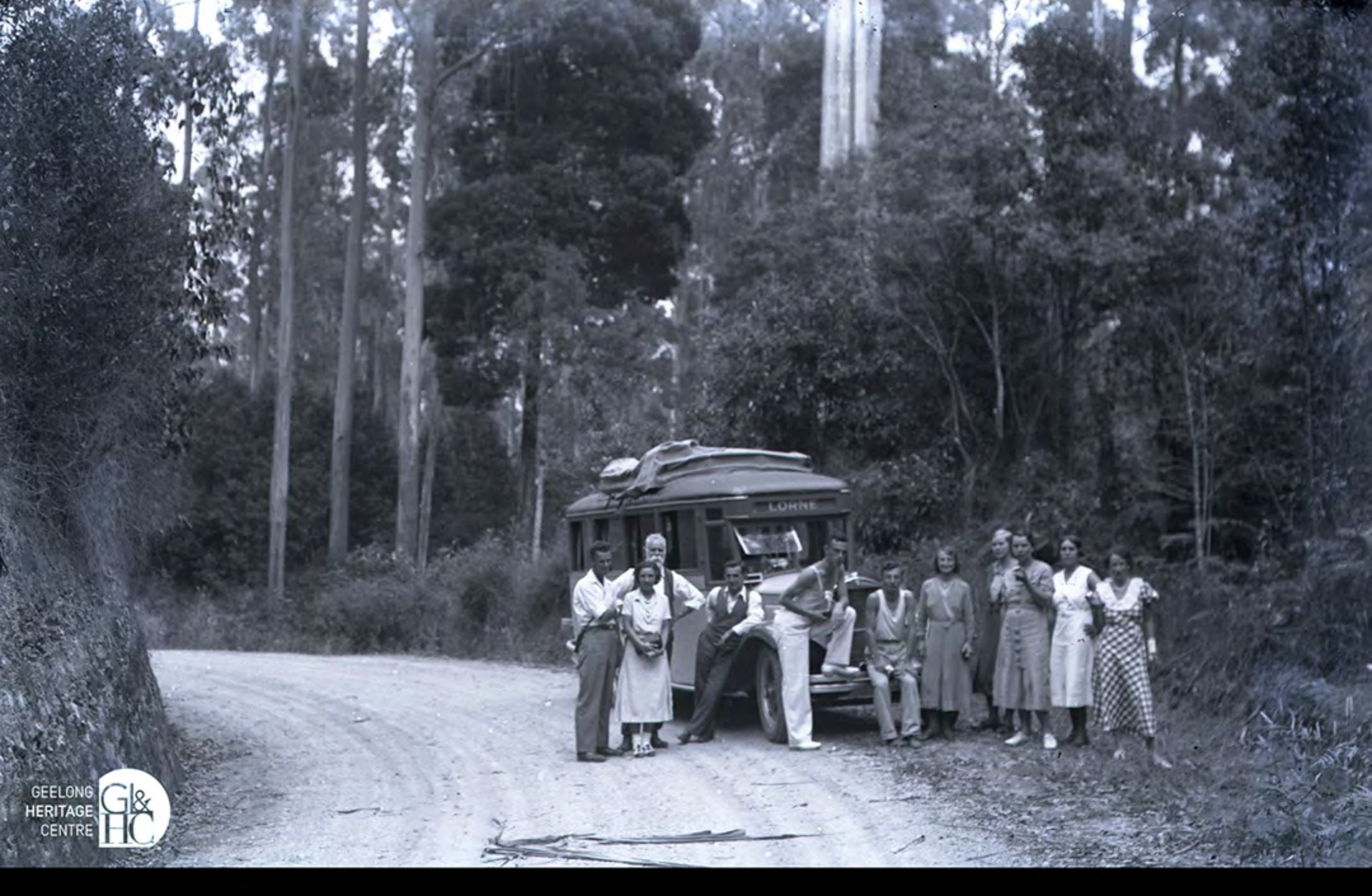
Lorne bus c1940 by AE Jarratt