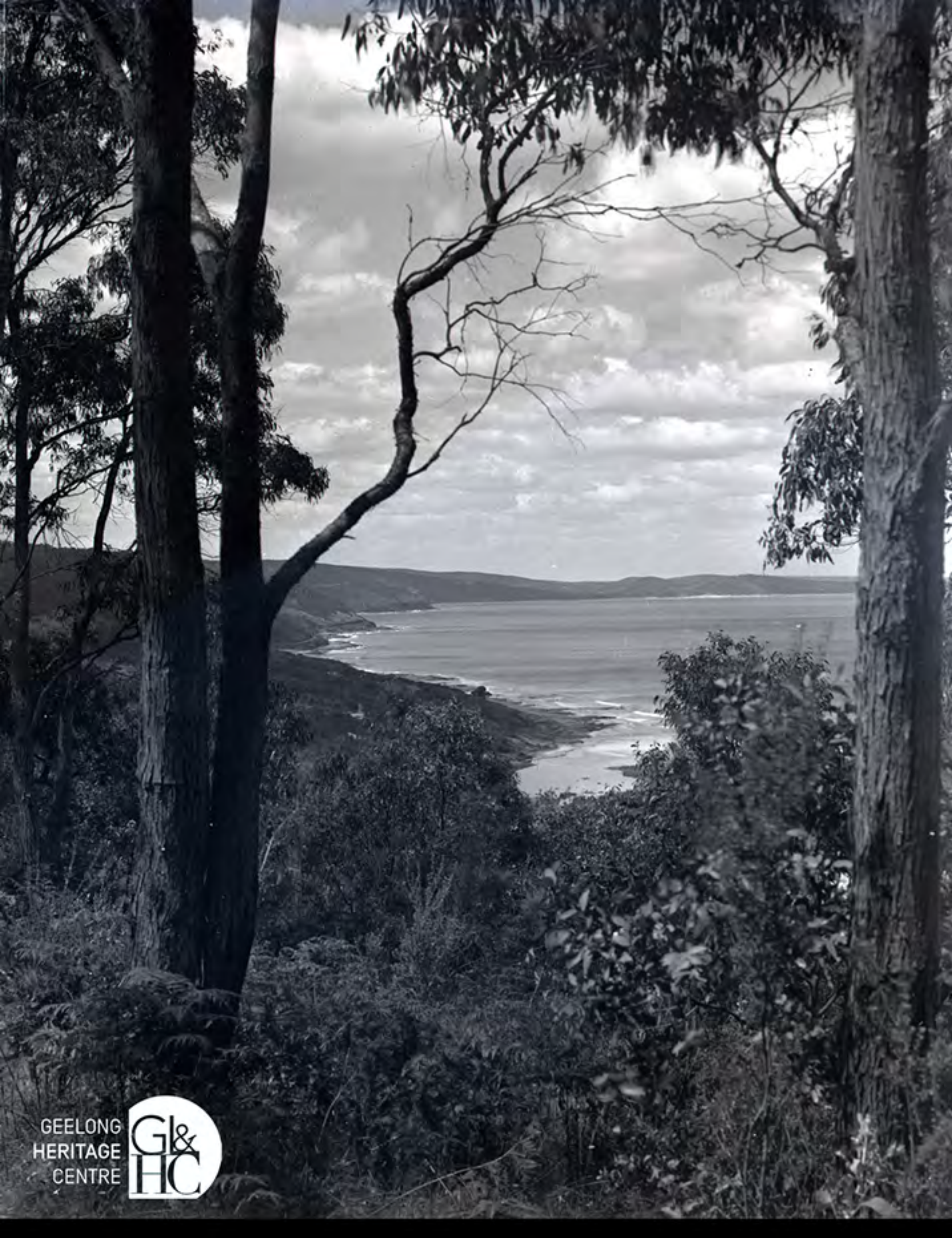
Lorne c1930 by AE Jarratt