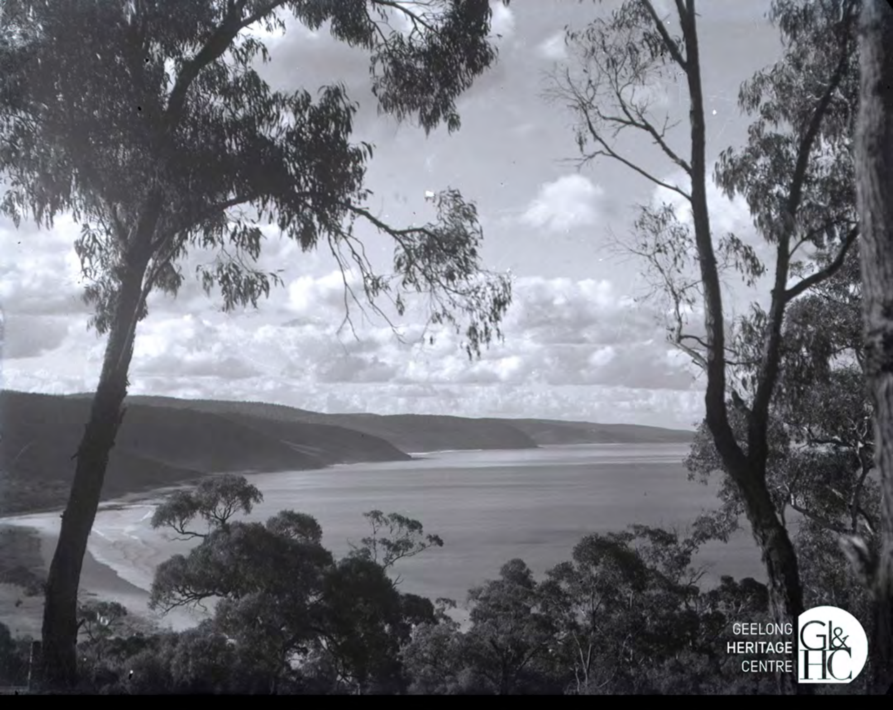
View from Lorne c1930 by AE Jarratt