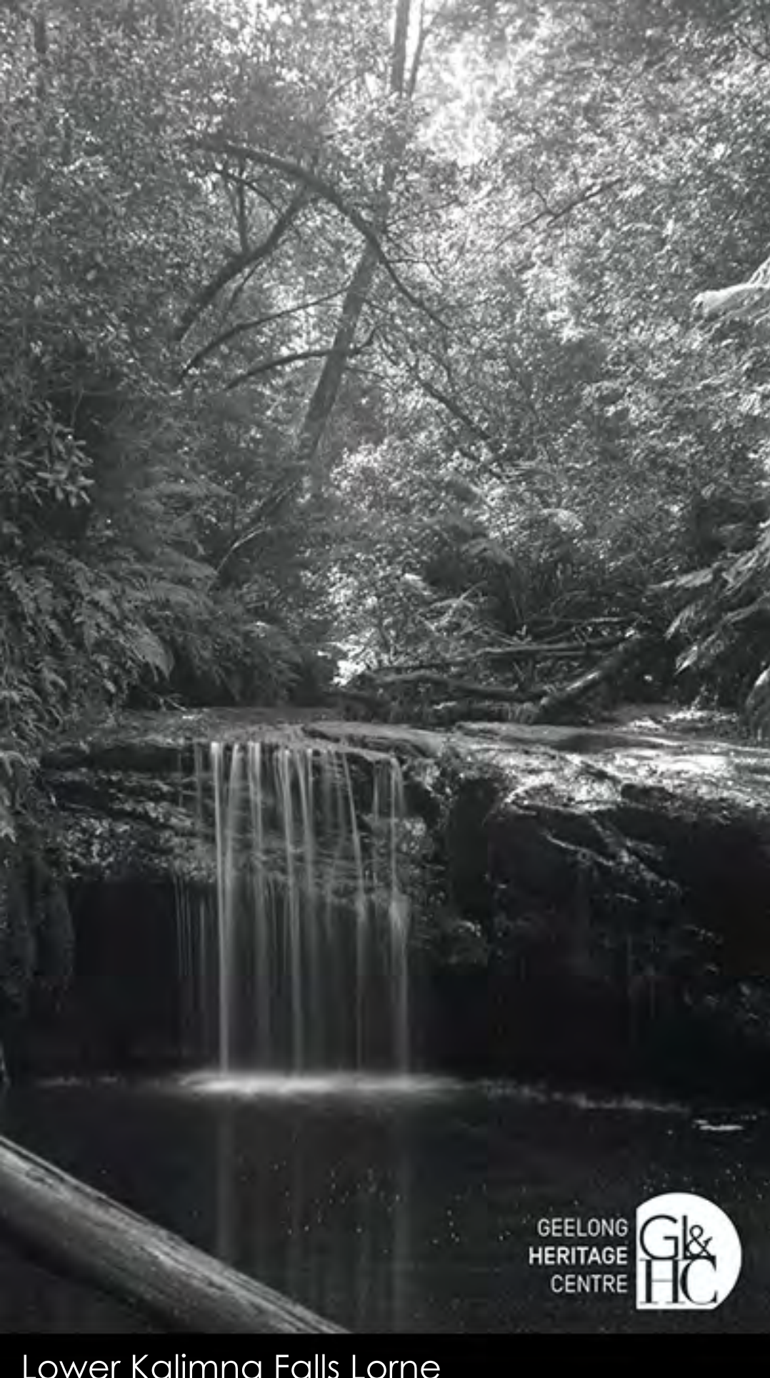
Lower Kalimna Falls Lorne c1930