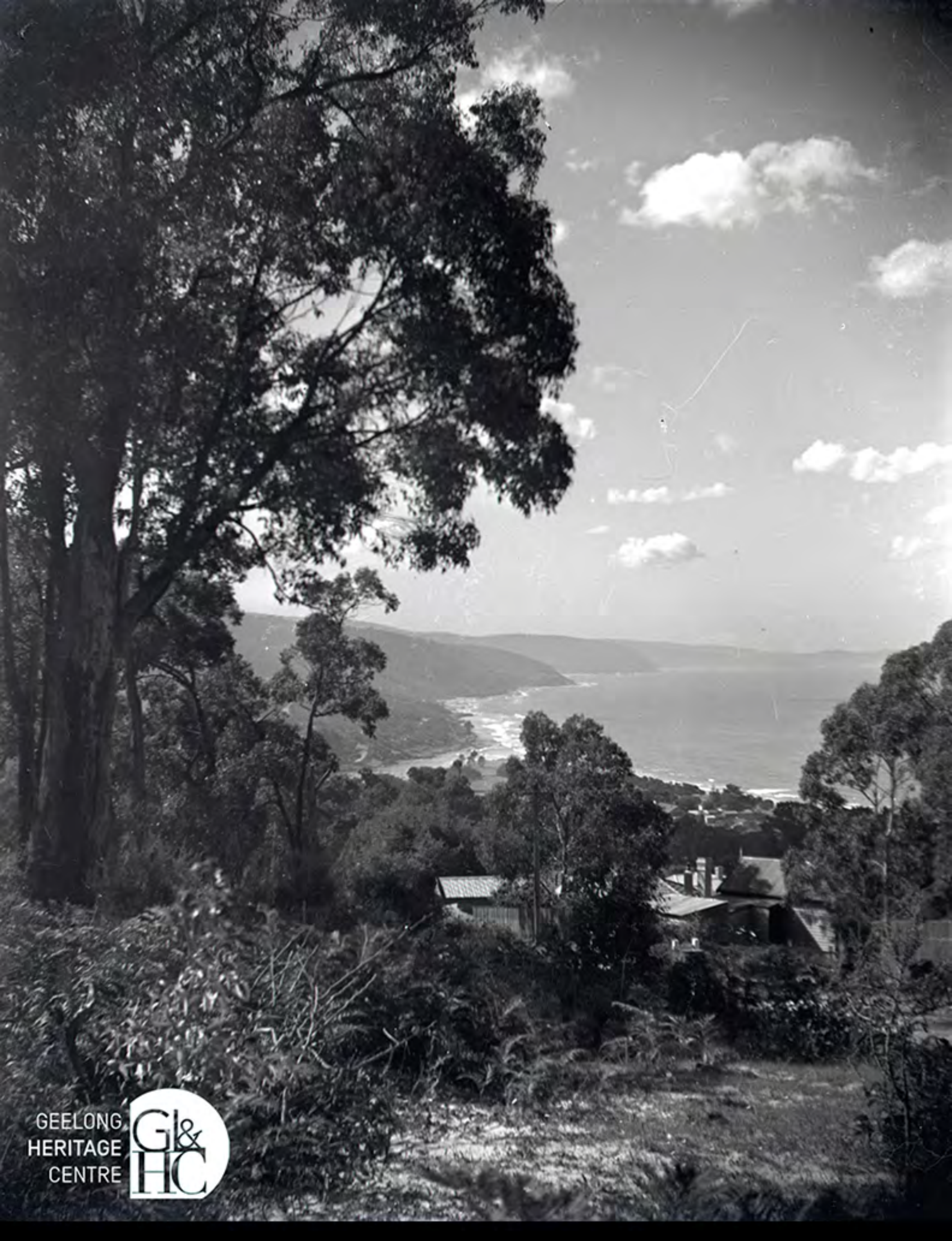
Lorne c1930 by AE Jarratt