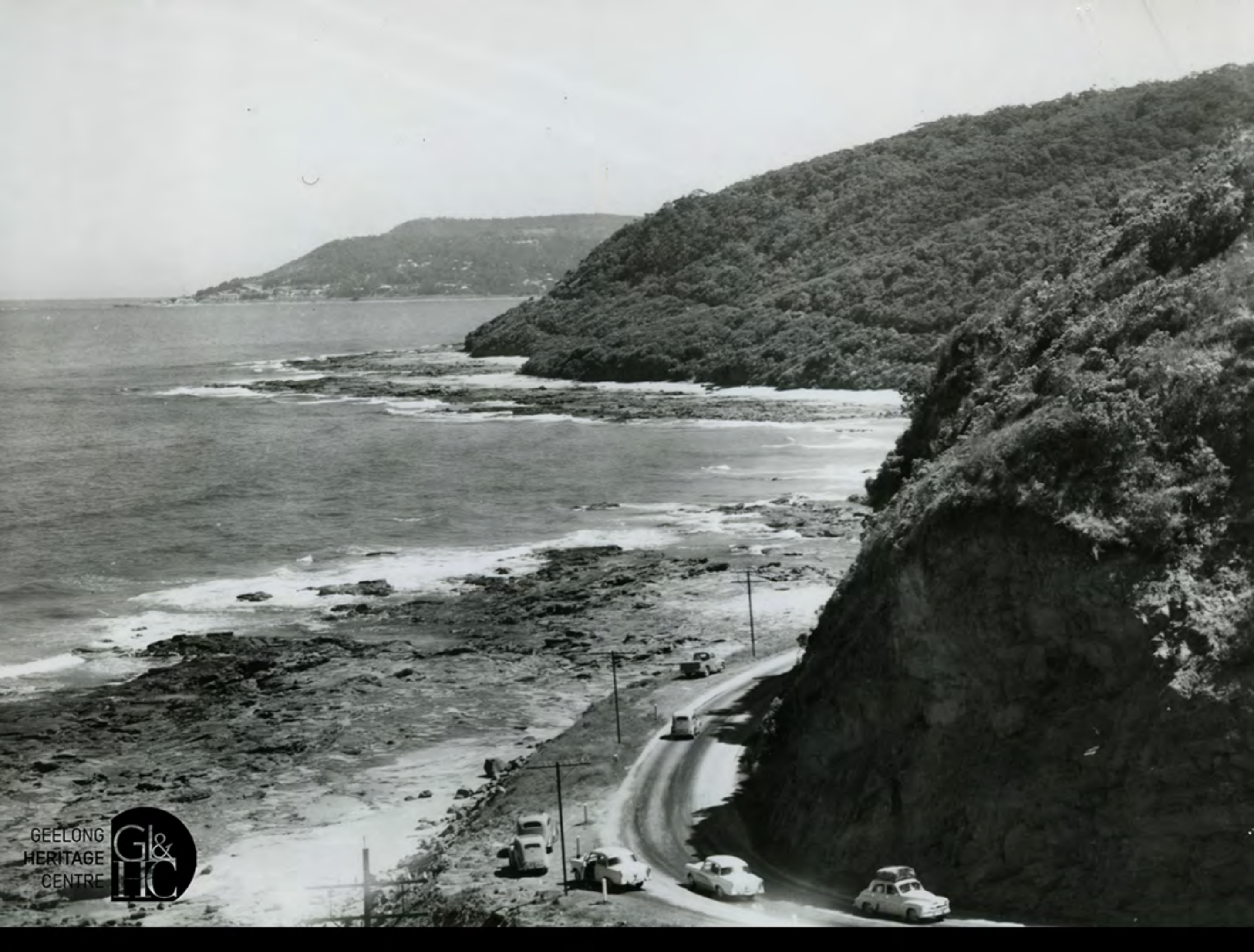
East of Lorne 1959