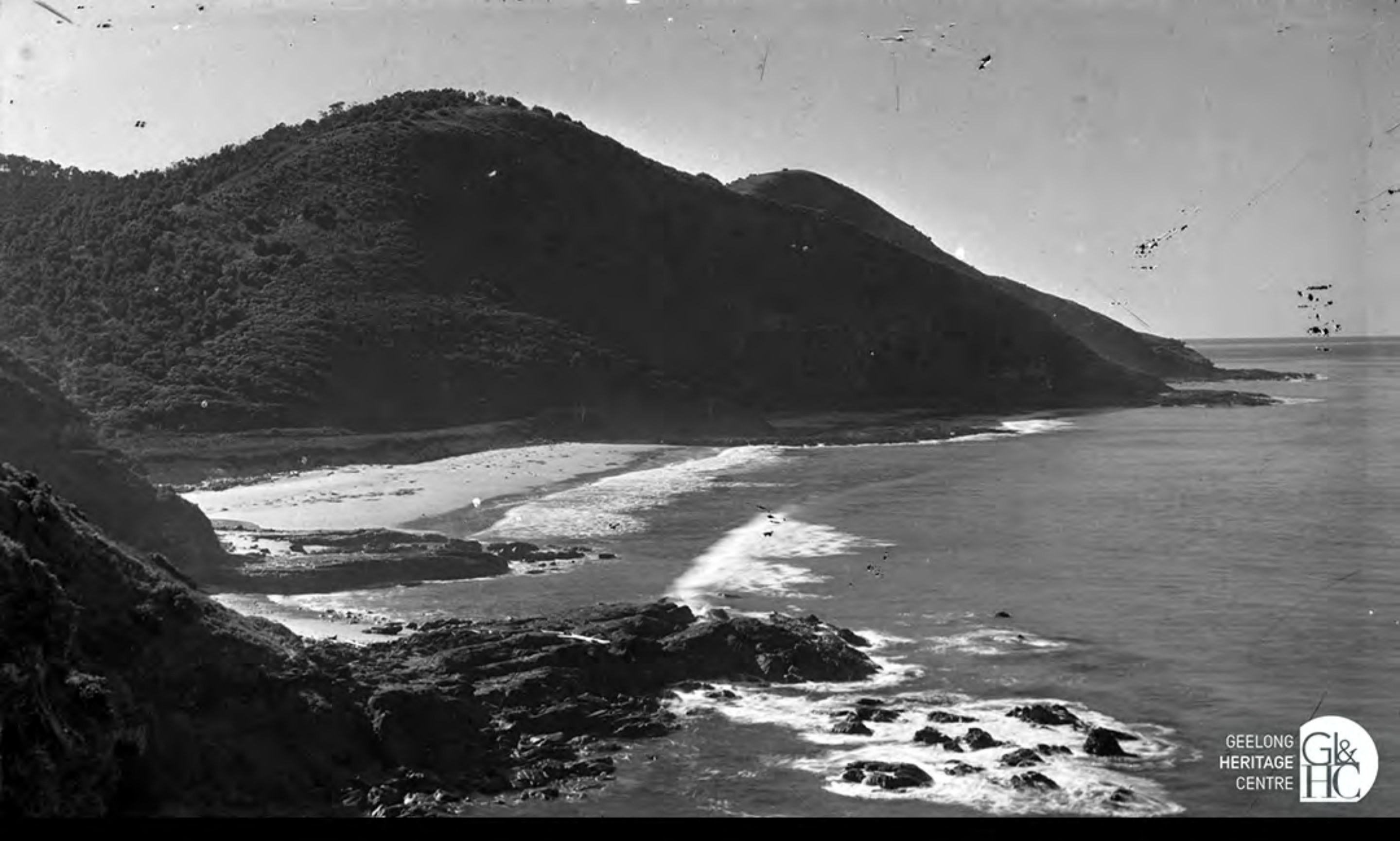
The Brothers at Lorne c1930 by AE Jarratt