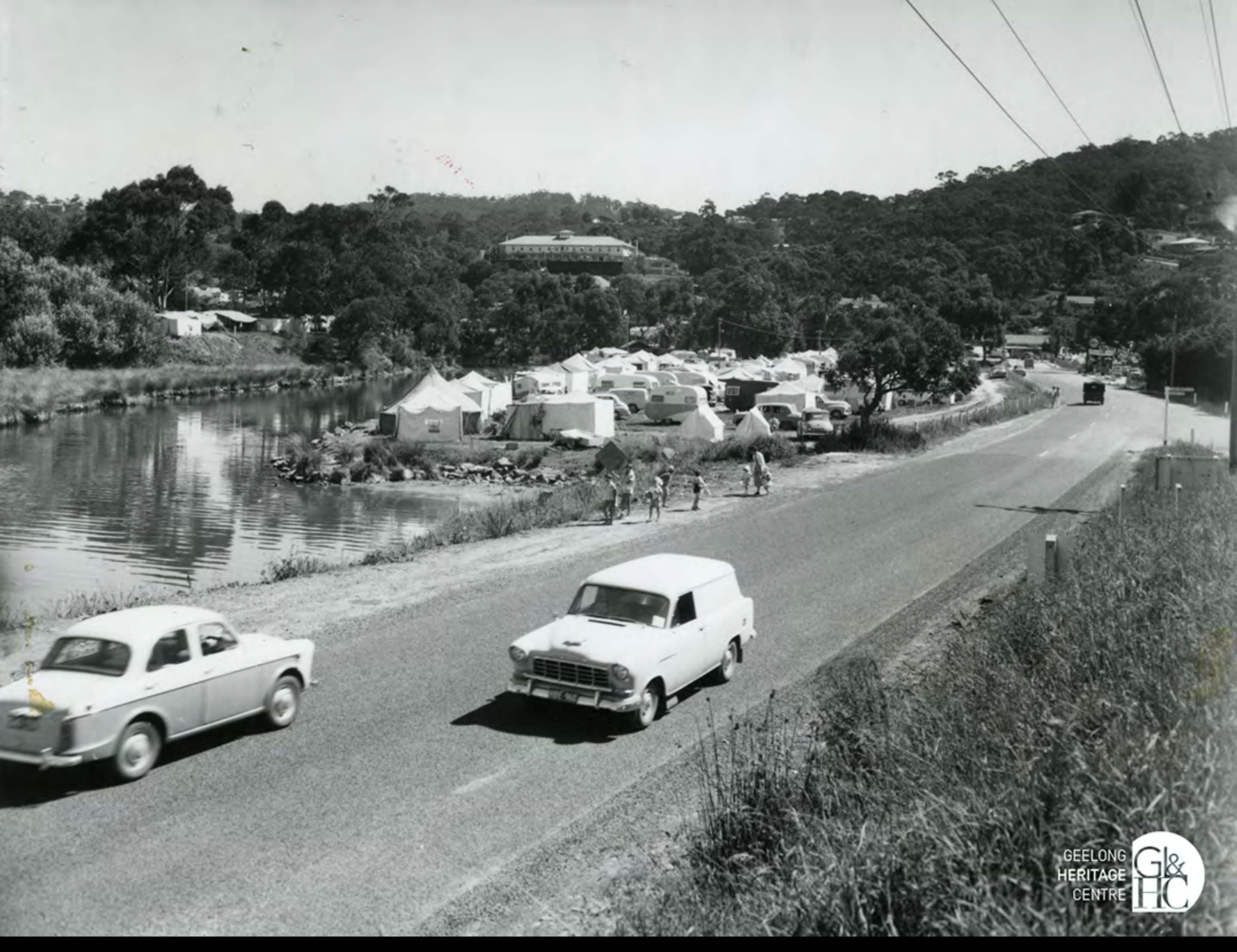
Camping area at Lorne January 1960